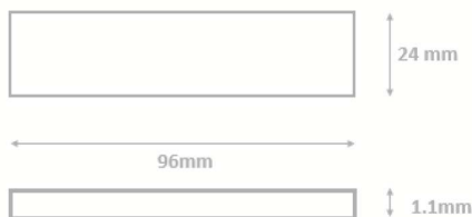
Dimensions stated in mm Supply format = 500 labels per roll