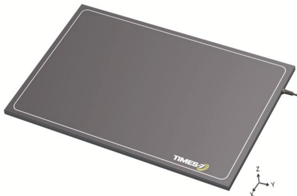
The SlimLine A7060

Our SlimLine range of antennas are unique in the RFID industry; offering high levels of performance & durability in an aesthetically superior form. Proven in a diverse & growing range of markets, applications include: retail & customer interaction, conference & people tracking, race timing, baggage handling, and logistic & supply chain asset management.