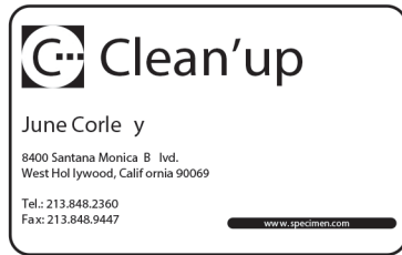
CR80 card 100% layout: approx 880 cards/roll*

Most of the Evolis monochrome ribbons are given for an average of 1,000 prints per roll. However, depending on the layout, the ribbon achieves a different number of prints, as demonstrated hereafter: