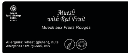
120mm card 80% layout: approx 780 cards/roll*