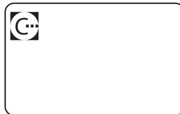
CR80 card 25% layout: approx 2,630 cards/roll*