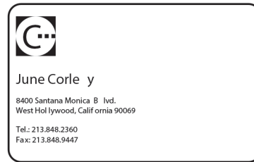
CR80 card 50% layout: approx 1,560 cards/roll*