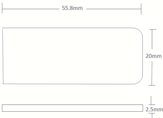
Dimensions stated in mm