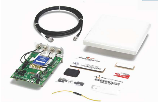
M6e Reader DevKit shown