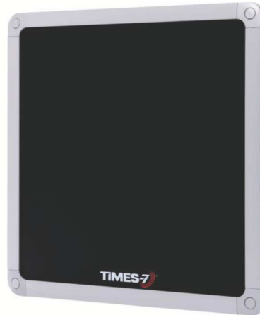
The SlimLine A4030C

Our SlimLine range of antennas are unique in the RFID industry; offering high levels of performance & durability in an aesthetically superior form. Proven in a diverse & growing range of markets, applications include: retail & customer interaction, conference & people tracking, race timing, baggage handling, and logistic & supply chain asset management.