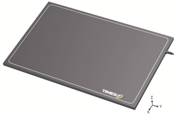
The SlimLine A7040

Proven in a diverse & growing range of markets, applications include: retail & customer interaction, conference & people tracking, race timing, baggage handling, and logistic & supply chain asset management.