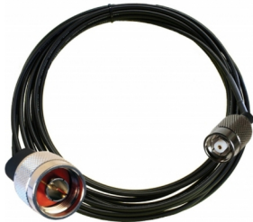
195-RP-TNC-M-N-Type-M-12 195-RP-TNC-M-N-Type-M-25 195-RP-TNC-M-N-Type-M-35