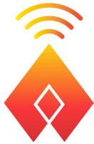
Vulcan RFID™ Explorer App