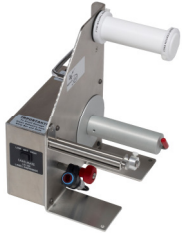
LD-100-RS-SS (Stainless Steel)

One look at these Label Dispensers compared to any others on the market will show you these are the highest-quality, easiest to use Label Dispenser products available. Labelmate USA Dispensers are simple, reliable and convenient. LABELMATE USA Dispensers use the latest Reflective Sensor technology to give you one simple adjustment for label length.