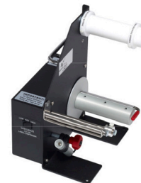
LD-100-U for all types of labels