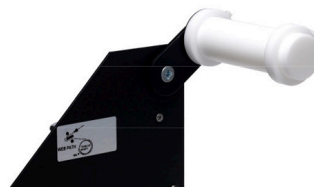
Optional LRB-12 Extension Bracket for any LD-100 Model. Allows use of label roll diameters up to 12"