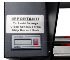
Optional LDC-1 Label Counter