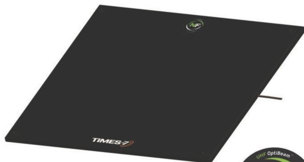
The A1030 Near Field Antenna

Proven in a diverse & growing range of markets, applications include: retail & customer interaction, conference & people tracking, race timing, baggage handling, and logistic & supply chain asset management.